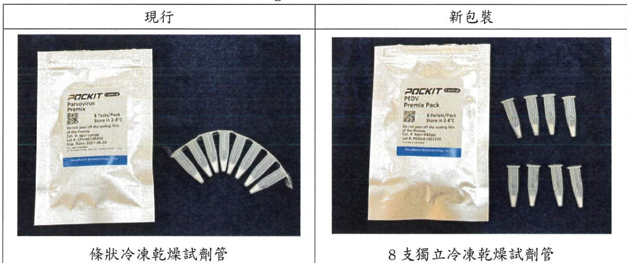
Table 1. POCKIT™ Central Premix Reagent 包裝變更

若您收到此通知後有任何問題或需要協助，歡迎與瑞基技術服務部 technical-service@genereachbiotech.com 聯繫。